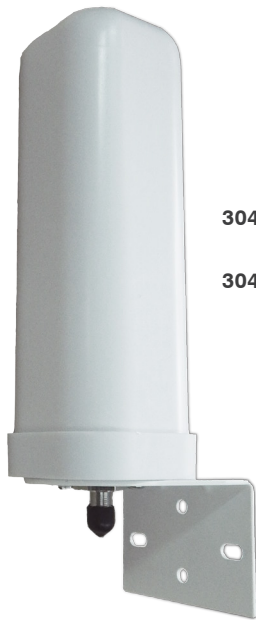
304424 4G Omni Building Antenna (50 ohm)